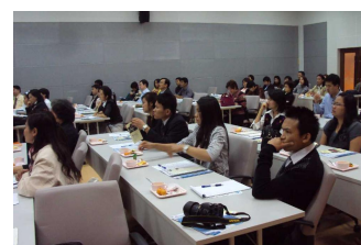
Participants at the seminar of Specific Research Centers