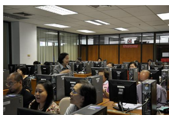
Participants of the Digital Repository Training.