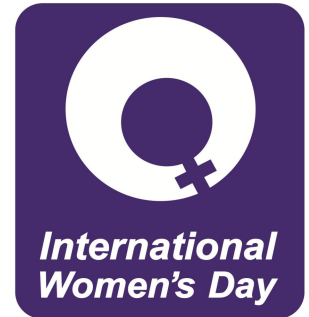
International Women's Day—8 March 2012.

men, the fact is that only around 10 percent of women really does. In addition, these women must have been through many 'lessons' during their lifetime to prove themselves that they are better than men in what they do, so that they can stand where they are now". The event also showcased the women's success in building up courage and on the issues and problems that prevents women on using their courage to benefit their needs and society.